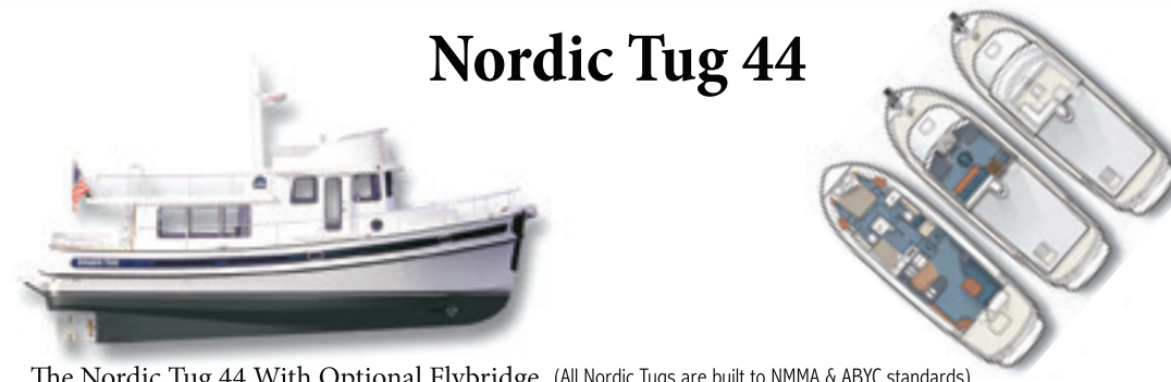
The Nordic Tug 44 With Optional Flybridge (All Nordic Tugs are built to NMMA & ABYC standards)