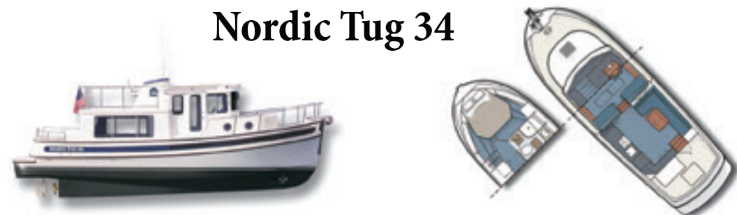
The Nordic Tug 34 With Optional Flybridge (All sizes shown come in pilothouse and pilothouse plus flybridge versions)