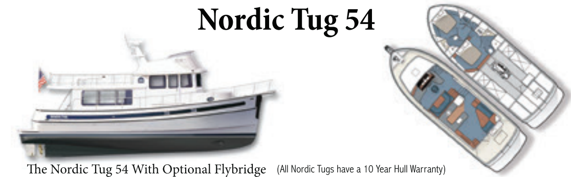
The Nordic Tug 54 With Optional Flybridge (All Nordic Tugs have a 10 Year Hull Warranty)