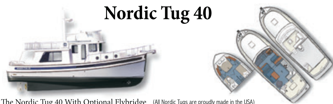
The Nordic Tug 40 With Optional Flybridge (All Nordic Tugs are proudly made in the USA)