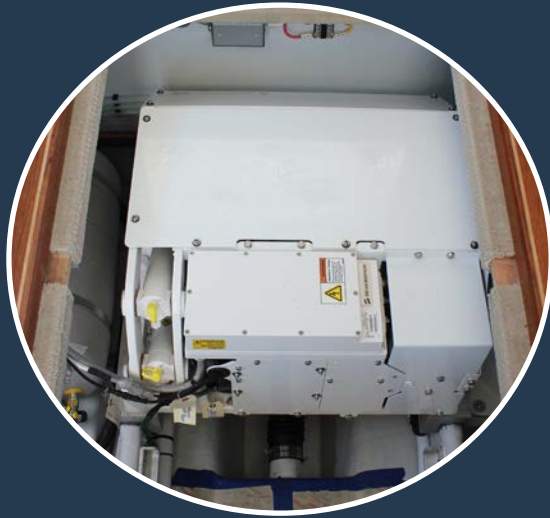
New SeaKeeper install Option available! (Gyro Stabilizer)