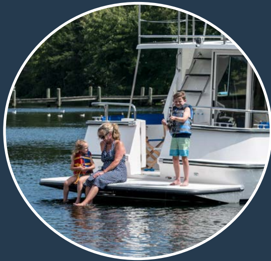
Longer Swimming Platform!