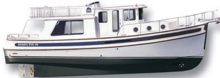
The Nordic Tug 40 Standard Model