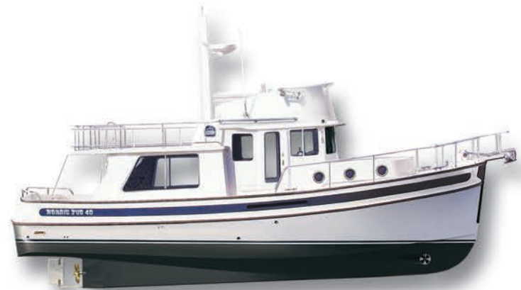
The Nordic Tug 40 with Optional Flybridge