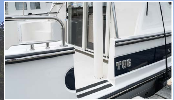
New Starboard Boarding Door!