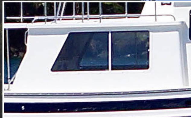
New Sleek Window Design!