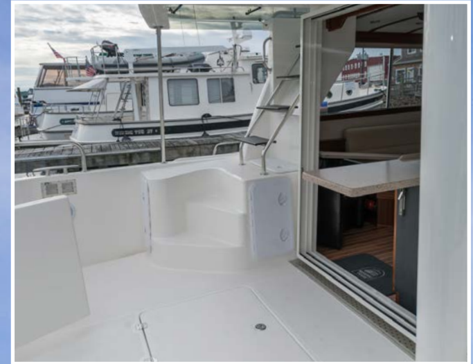
New Solid Staircase and Ladder to upper Deck & Sliding Doors for Entry from Cockpit to Salon.