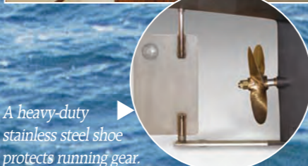
A heavy-duty stainless steel shoe protects running gear.