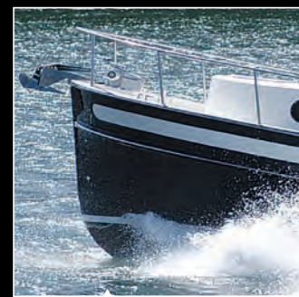
A fine-entry bow makes for a quiet ride in choppy seas.