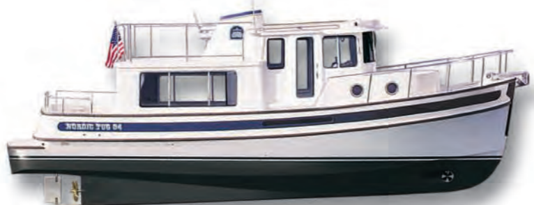
The Nordic Tug 34 Flybridge Model with Chariot-style Bridge.