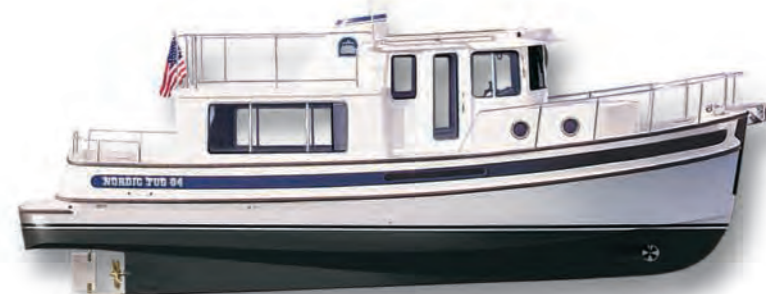
The Nordic Tug 34 Standard Model.